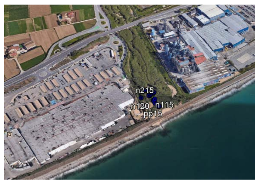
Figure 1 Localize data in Google Earth (Argentona Site)

Thomas asked if there is a specific format, thinking about geophysics. There is not, however it would be nice to have one, to be consistent and create a norm.