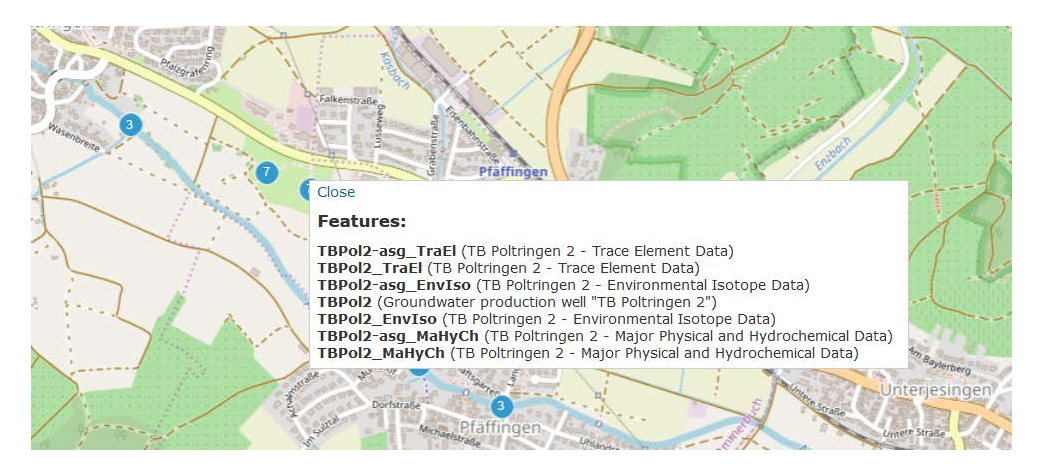
Figure 3 Access to data in the Campos database

CAMPOS – Catchments as Reactors Collaborative Research Center at the University of Tübingen – database collects point information, profile data, time-resolved data and modeling outputs. Carsten presented the structure of the database as well as the insertion process. Then, he took the Lauswiesen site as an example.